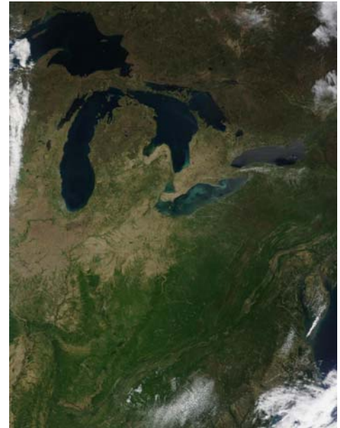
Above: a true-color MODIS image from May 22, 2002. You can clearly see that spring has started in the south (green), but that the north is still leafless (brown). The white areas are clouds Left: Different methods for describing land surface phenology. Below: Land surface phenologies across CONUS in 2000 revealed by three AVHRR biweekly composites.